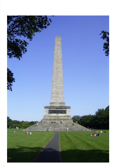
The Wellington Monument