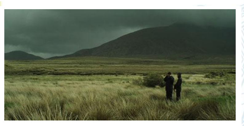
For further information on Silence , visit: <a href="http://harvestfilms.ie/silence">http://harvestfilms.ie/silence</a>